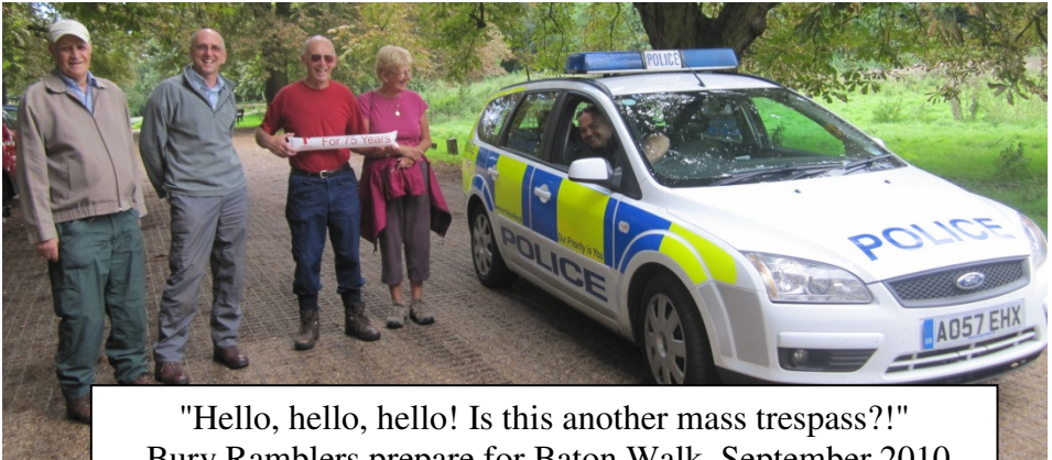
"Hello, hello, hello! Is this another mass trespass?!" Bury Ramblers prepare for Baton Walk, September 2010